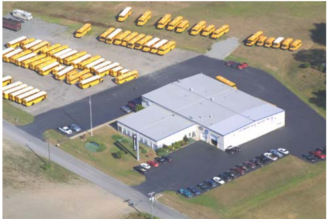
Leonard Bus Sales, Deposit, NY